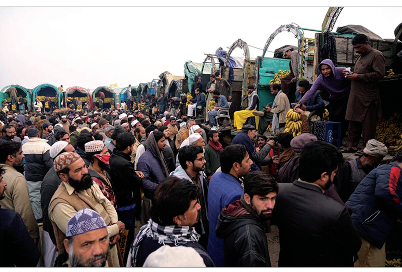
ISLAMABAD: Vendors displaying banana for bidding in connection with upcoming Holy Month of Ramadan at Islamabad Fruit and vegetable market. APP

HYDERABAD: WAPDA worker busy in installed electricity cable on the electric pole at Autobahn Road. APP