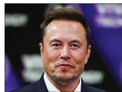
"In the long term, Neuralink hopes to play a role in AI risk reduction and civilizational risk reduction by improving human-to-AI (and human-to-human) bandwidth by several orders of magnitude. Imagine if Stephen Hawking had had this." Musk wasn't the first to introduce a brain chip as long before he entered the game, Utah-based Blackrock Neurotech implanted its first of many brain-computer interfaces in 2004.

In addition, it aspires to enhance human capabilities and bring them to par with AI. Musk said in an interview, "This ultimately has the potential to restore full body movement."