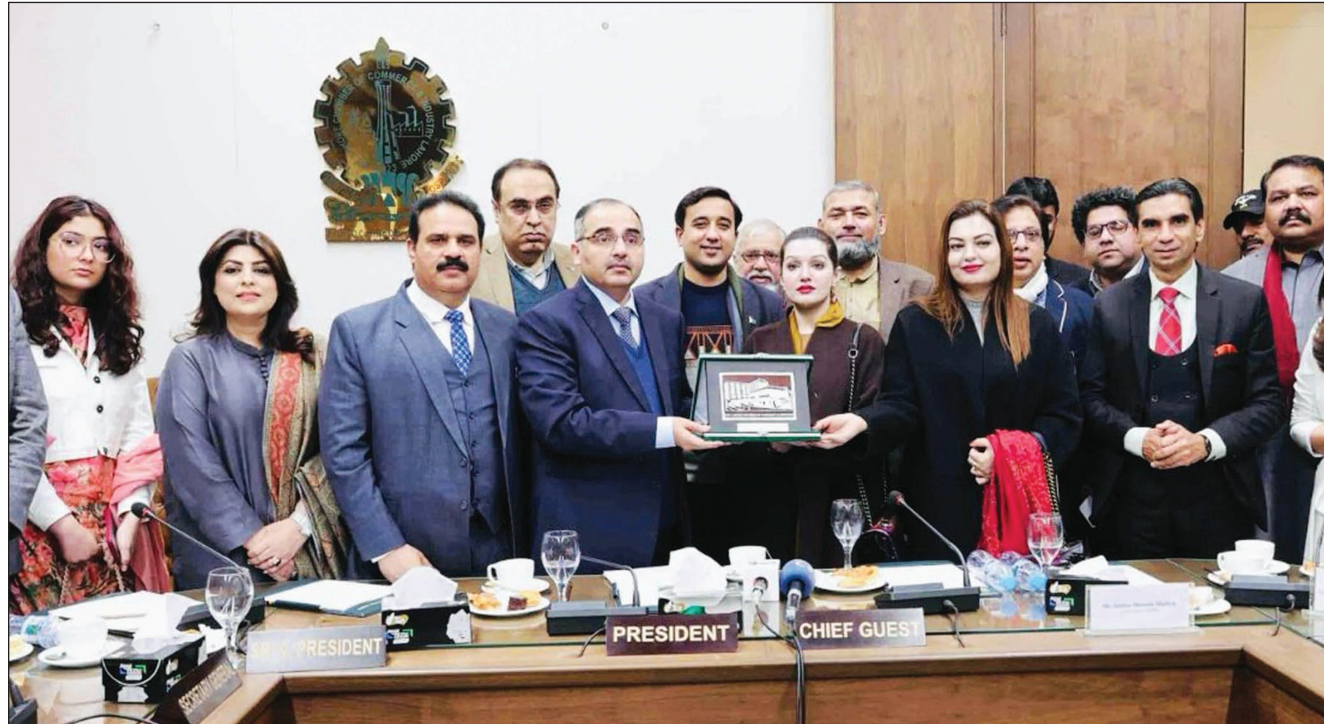
Special Assistant to Prime Minister for Human Rights and Women Empowerment Mushaal Hussein Mullick is being presented with a shield at Lahore Chamber of Commerce and Industry (LCCI).

Following the incident, Pakistan had strongly condemned the killings of its nationals in Iran terming it, "horrifying and despicable." It underscored the need to immediately investigate the incident and hold accountable those involved in this heinous crime, the spokesperson had earlier said. Pakistan had reiterated its firm resolve to fight terrorism and was taking all necessary measures in this regard.