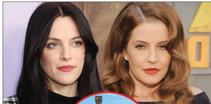
obtained by TMZ, Barclays asserts that Lisa Marie had an outstanding balance of approximately $1.6 million on Coes Hall and alleges that Lisa personally guaranteed repayment when securing the loan.

The eldest daughter of the late Lisa Marie Presley, now responsible for her mother's trust following Lisa Marie's passing last year, seeks judicial protection against shouldering the hefty bill presented by a bank. The focal point of this dispute revolves around an 11-bedroom estate named Coes Hall in Rotherfield, acquired by Lisa Marie Presley in 2010 with financial backing from Barclays Bank. According to legal documents