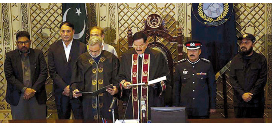
PESHAWAR: Speaker KP assembly Mushtaq Ghani administers oath to newly elected speaker Babar Saleem Swati.

The election for the Speaker and Deputy Speaker of the National Assembly is scheduled to take place on Friday. DNA