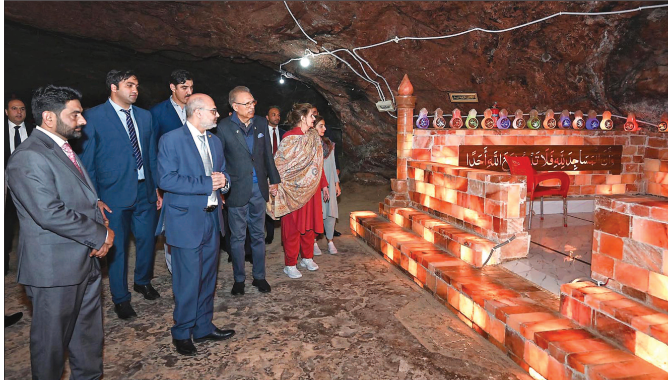
KHEWRA: President Dr Arif Alvi being briefed about salt mining during his visit to the Khewra salt mines.

The NA Secretariat said that candidates can collect the nomination papers from the legislation department. "The candidates are asked to submit their nomination papers to the NA Secretariat," the schedule read. It is pertinent to mention here that Shehbaz Sharif has been nominated by the Pakistan Muslim League-Nawaz (PML-N), Pakistan People's Party (PPP), and other allies for the slot. While the Sunni Ittehad Council (SIC) named Omar Ayub as its candidate for the prime minister's slot. APP