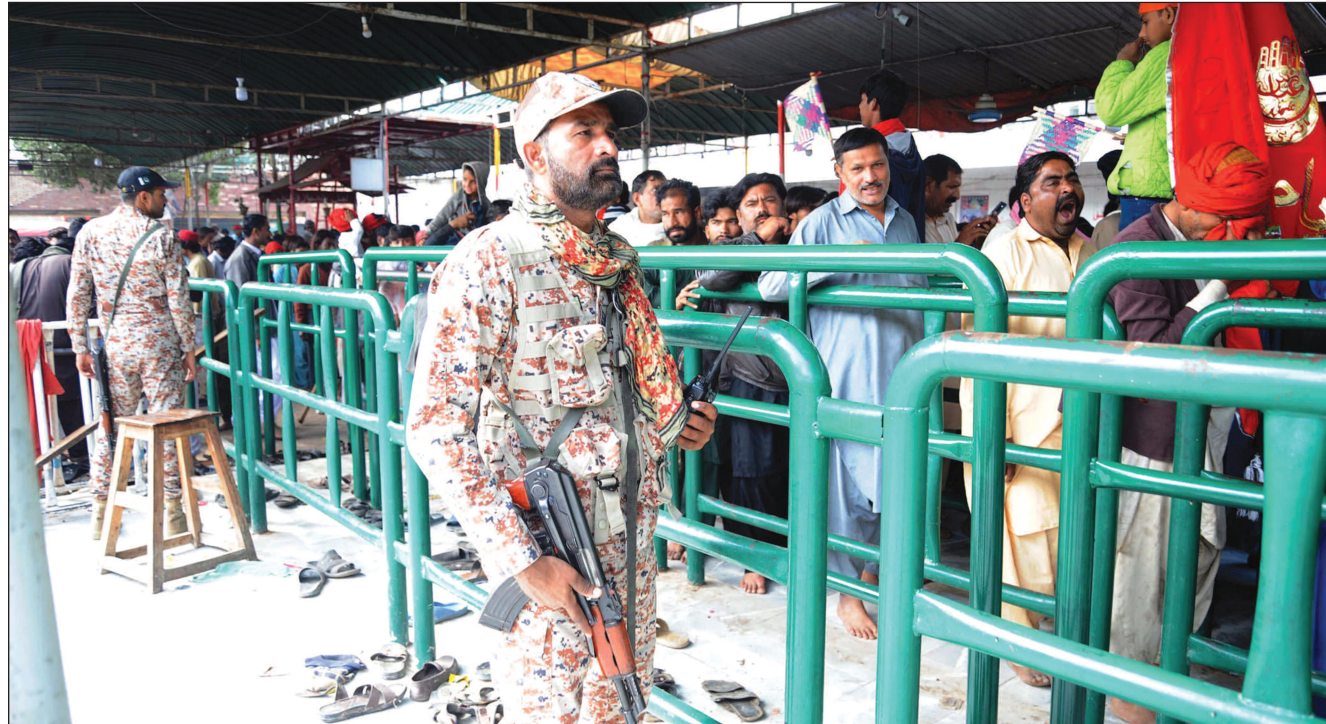
SEHWAN: Security personals stand alert during annual Urs of Hazrat Lal Shahbaz Qalandar at shrine of Sufi saint Hazrat Lal Shahbaz Qalandar, at Sehwan Sharif.