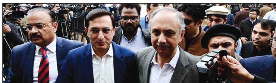
ISLAMABAD: Newly elected Members of National Assembly Omar Ayub Khan and Barrister Gohar Khan arrives to attend 1st session of 16th National Assembly at Parliament House.