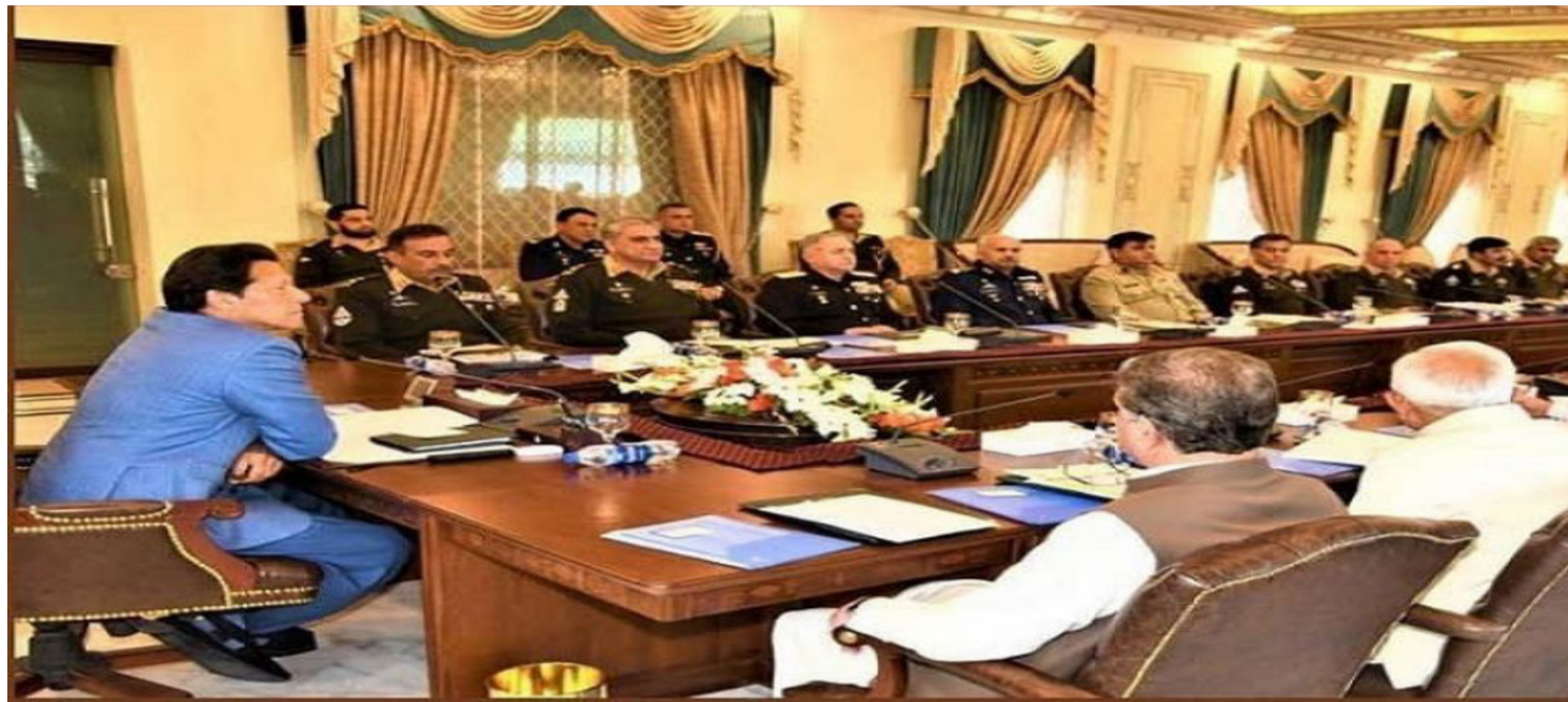
Karachi's uplift vital to boost economic activities

He said that China had very effectively fought the pandemic and Pakistan was taking all steps necessary to contain the spread. "We took proactive measures and that's why not many [people] were affected by the pandemic," he said. Qureshi added that people should "refrain from going to cinema houses, movie theatres, marriage halls, and public gatherings". "People attending mass gatherings should act responsibly." Speaking of the PCB's decision to hold matches in empty stadiums, the foreign minister said that "people can watch the matches on their TVs". "We have no other choice," he added.