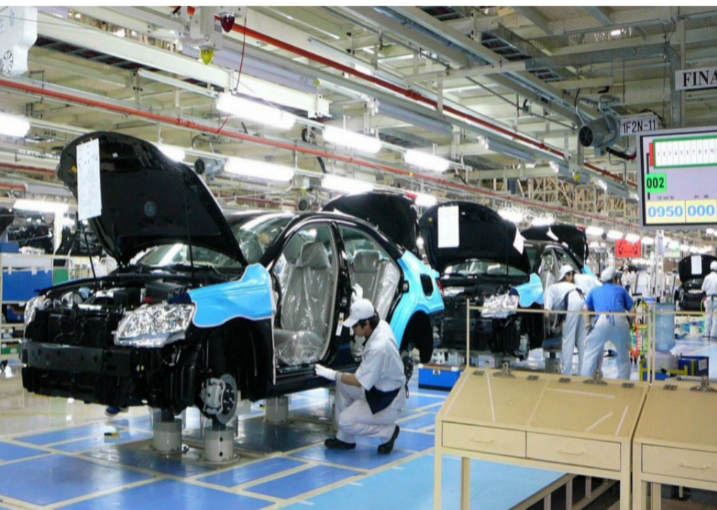
Automakers in China are calling on the government to help after industry-wide sales plunged 79 percent in February to mark their biggest ever monthly decline, with demand pumelled by the coronavirus outbreak.

The Central Directorate of National Savings (CDNS) has achieved collection net target of Rs150 billion by March 10 of fiscal year 2019-20. The CDNS has set Rs 352 billion annual collection target for the year 2019-20 as compared to Rs 324 billion for the previous year's 2018-19 to enhance savings and promoting saving culture in the country, senior official of CDNS said here on Friday. The directorate has also revised and increased the gross target of Rs1570 billion for fiscal year 2019-20, he said. Replying to a question, he said CDNS had collected Rs 410 billion by June 30, exceeding the target of Rs 324 billion set for the year while during the preceding year of 2017-18, CDNS collected Rs155 billion. The total savings held by the CDNS stood at Rs 1,150 billion by June 30 while the directorate had Rs 774 billion savings by the same date, a year ago, he said. The senior official said due to the rationalization of CDNS certificates' rates, the directorate had collected more savings than expected, therefore CDNS revised its target upward from Rs 224 to 324 billion for FY 2018-19. Replying to a question, he said CDNS interest rate on the investment bonds observed no revision of certificates rates due to current market situation and stand unchanged. "The National Savings interest rates are linked with the policy of PIB set by State Bank of Pakistan (SBP)", said a senior official of CDNS said.