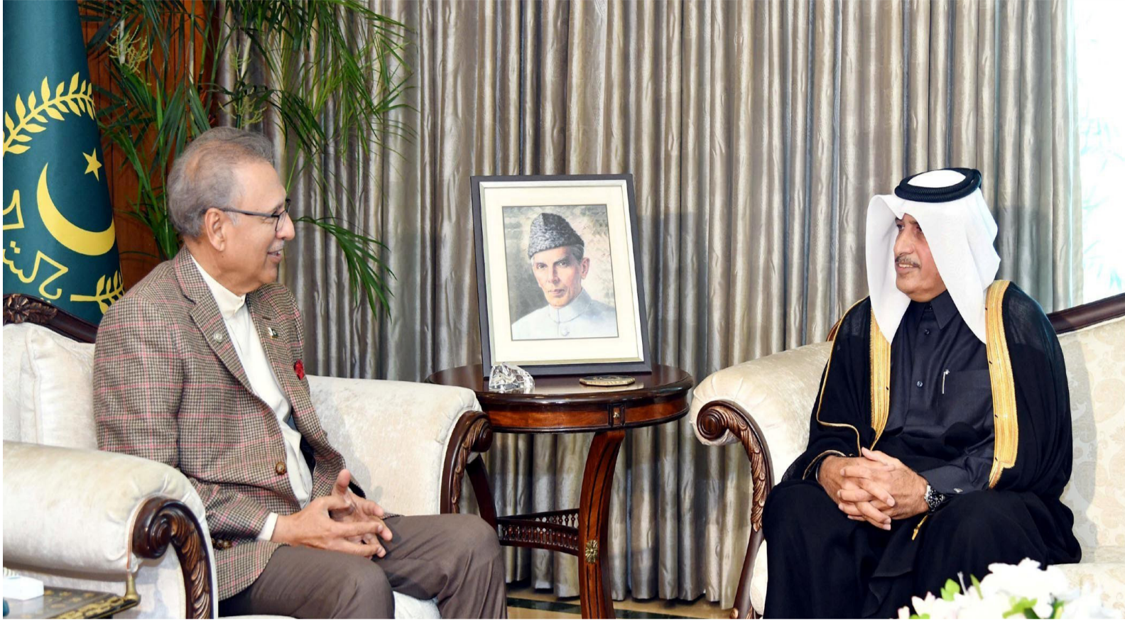
President to visit China